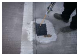
Inject Concrete Welder