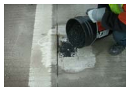
Fill Void with Stone